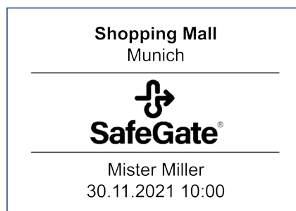
Example access authorisation